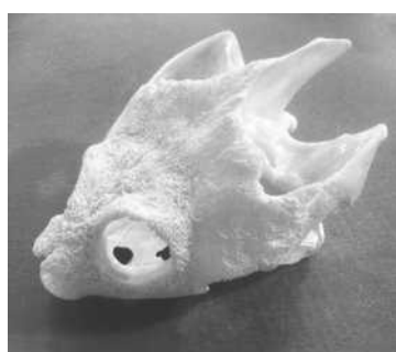
PAT MYERS/THE WASHINGTON POST

THE STYLE CONVERSATIONAL The Empress's weekly online column discusses the new contest and results. Especially if you plan to enter, check it out at wapo.st/styleconv .